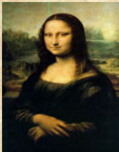
wPĪ Kg©. tgvbvĵj mv (1503-1506)